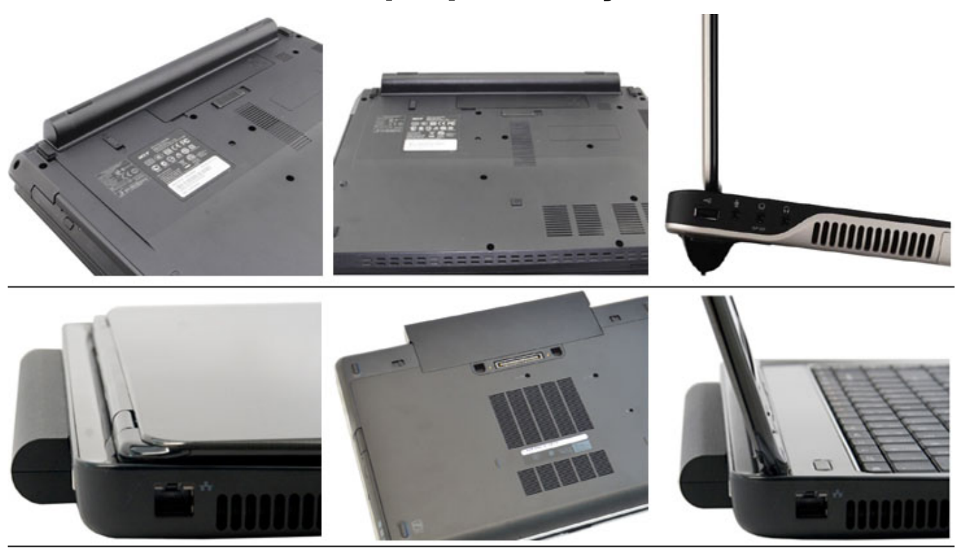
High capacity batteries (8 cell & 9 cell & 12 cell) with bigger size(shape), will protrude out the bottom or side of the laptop.

Unique solution ID: #1035 Author: Secure-Battery.com Last update: 2022-11-26 13:29